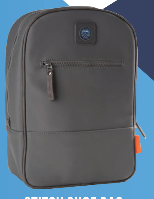
STITCH SHOE BAG